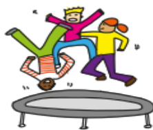
Rough and Tumble Play